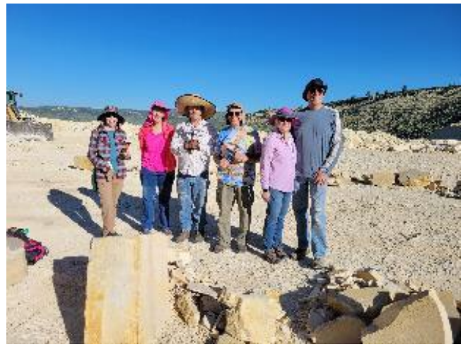
Kemerer fish quarry field trip