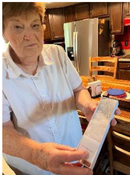
The Lovitt's receiving the gift card and pendant.