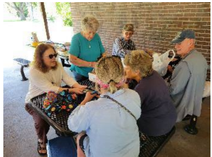
2022 club picnic grab bag prep.