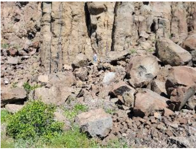
North Table Mountain trip