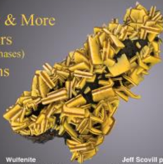
Wulfenite Mina Ojuela, Mexico

$100 Show Dealer Voucher Giveaways every day at 12:00PM & 4:00PM You need to be present to win