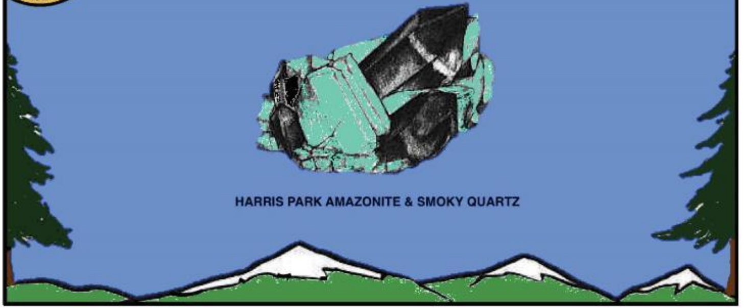
HARRIS PARK AMAZONITE & SMOKY QUARTZ

LITTLETON GEM and MINERAL CLUB P.O. Box 283 Littleton, CO 80160