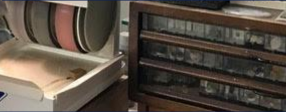
Here are their displays at the Denver Gem and Mineral Guild Show in Feb. at the Jeffco Fairgrounds.